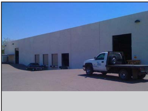
4 DOCK HIGH & 2 GRADE LEVEL DOORS