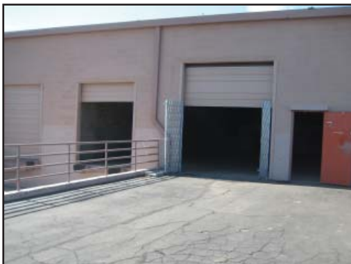
1 TRUCKWELL & 1 GRADE LEVEL DOOR