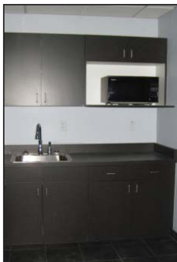
NEWLY UPDATED OFFICE AREA